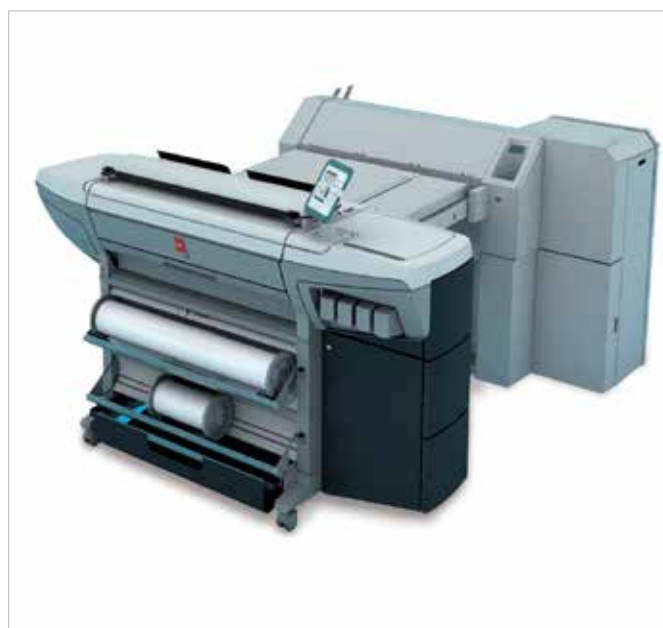
Océ estefold 4211