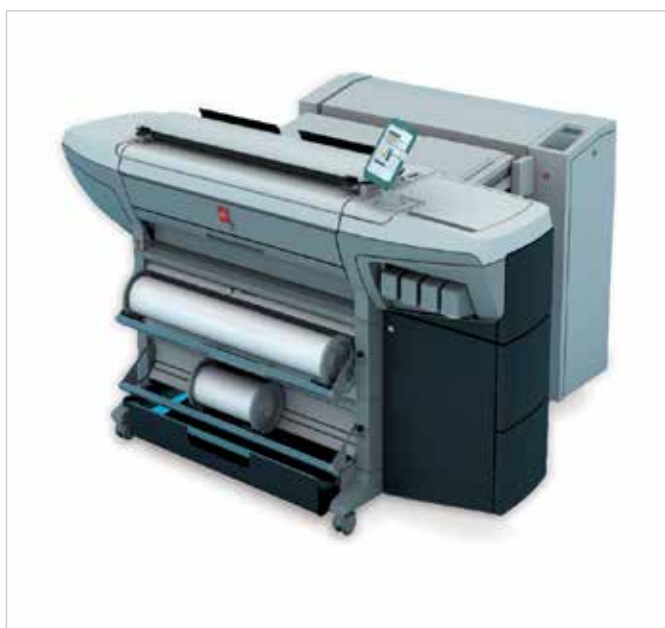
Océ estefold 2400