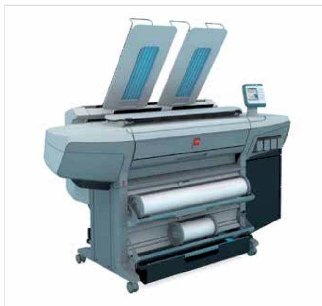
Océ CW 300 MF TDT