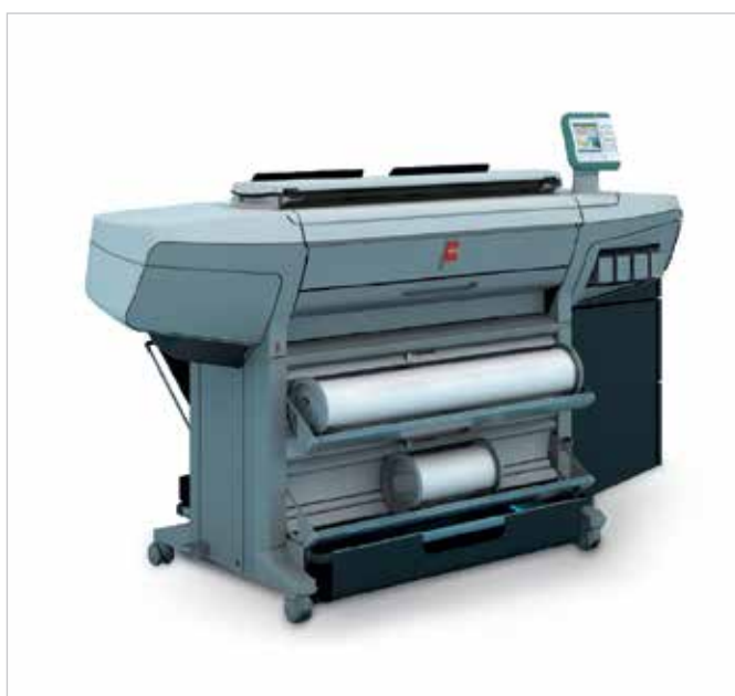
Océ CW 300 MF Printer